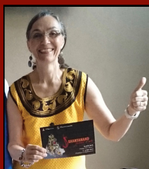
A Celebration of Deepavali at TFA, November, 2015